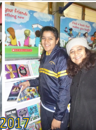
Book Fair - 3 August 2017