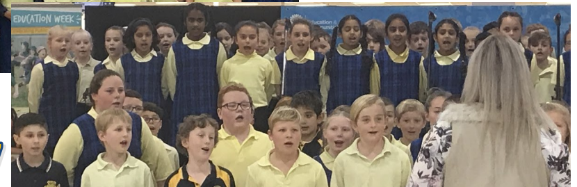
Education Week Market Place 2 August 2017