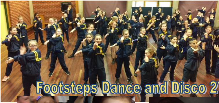
Footsteps Dance and Disco 27 July