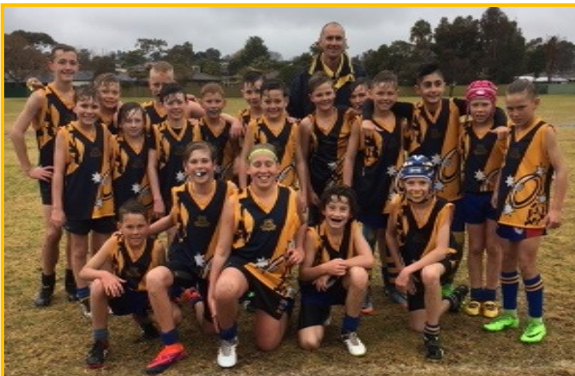
Tony Lockett Shield