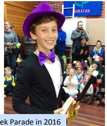
Photos from the Book Week Parade in 2016