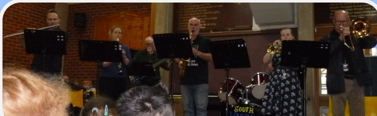
Performance by Riverina Conservatorium of Music tutors, School Assembly, Friday 25 August.