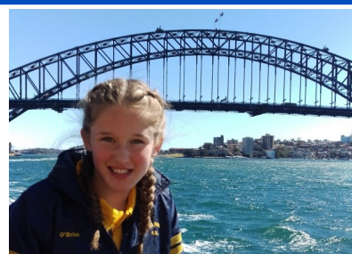
Stage 3 Sydney Excursion 5-7 September 2017