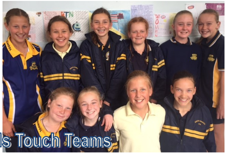
Boys and Girls Touch Teams