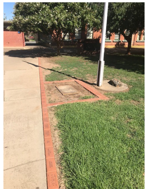
125 Year Anniversary Paving

If you are interested in this position, please reply to this advertisement directly with your resume and cover letter which addresses the Essential and Desirable Criteria no later than Friday 9 th February 2018.