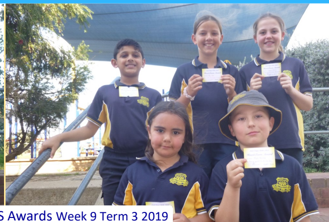
Achievement and Learning @ SWPS Awards Week 9 Term 3 2019