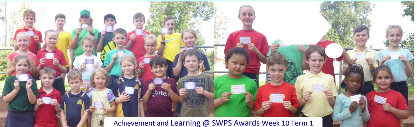
Achievement and Learning @ SWPS Awards Week 10 Term 1