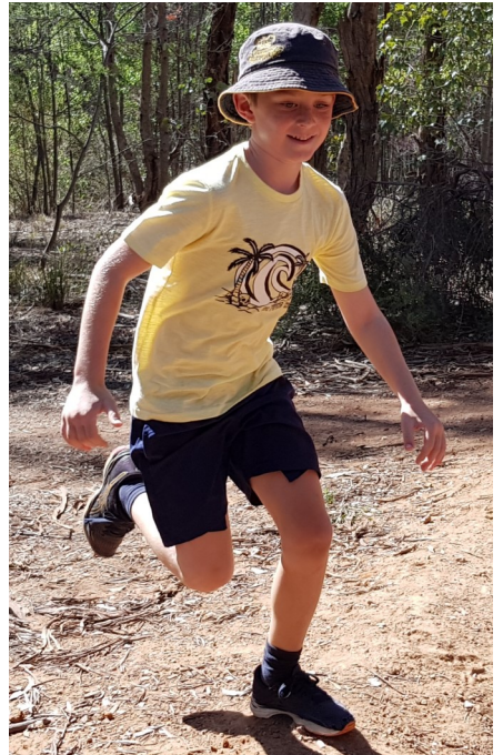
Cross Country 5 April 2019