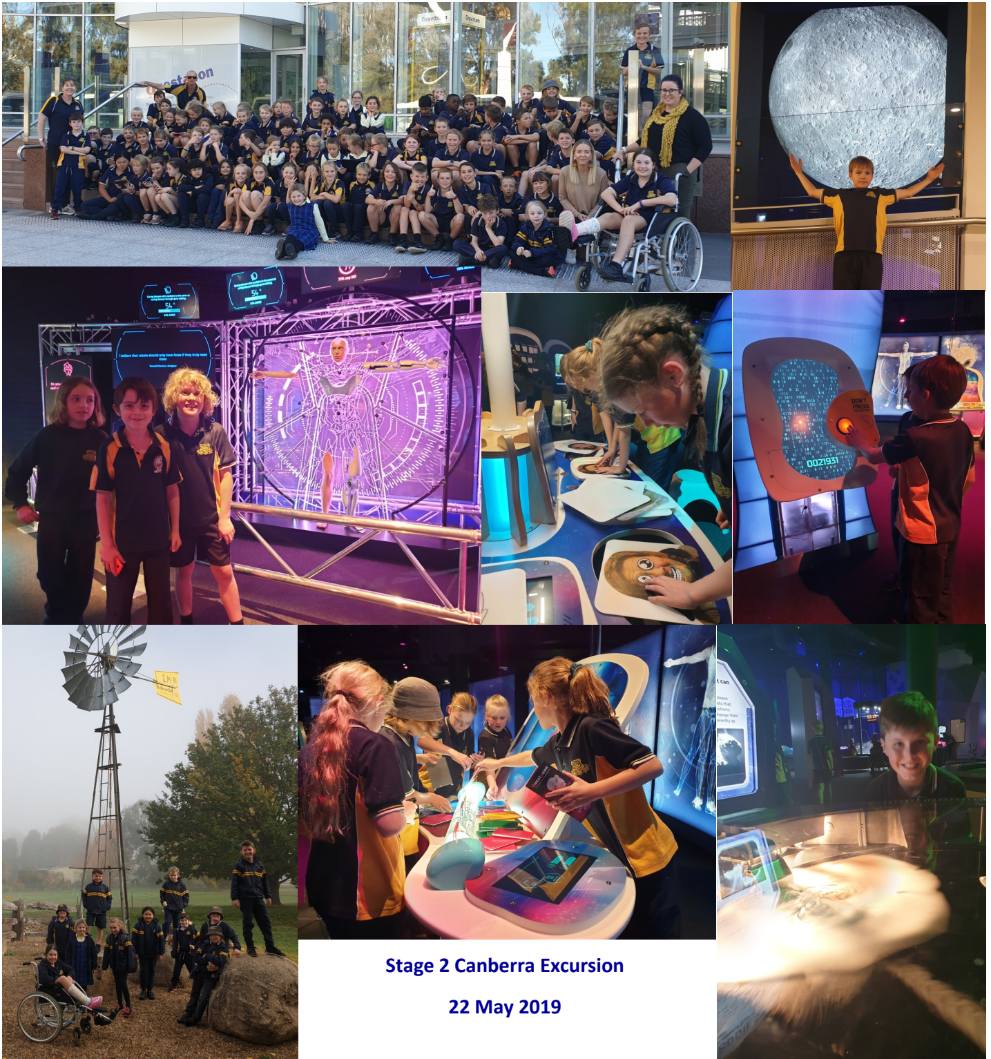
Stage 2 Canberra Excursion

Well done to all of Stage 2 on a great day.