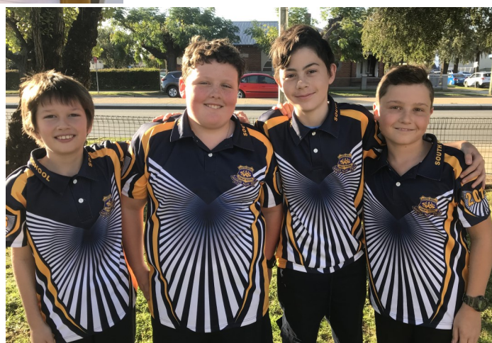
Our Year 6 shirts have arrived and don't they look great!

What a buzz for our dance group last Friday 17 May as they participated in the 2019 Wagga Dance Eisteddfod at Kyemba Smith Hall. The group (Pictured on the front page) arrived early to change into full dance costume and they were nervous and excited! Proudly, they received a 'Highly Commended' for their performance, with the judges making special mention of their beautiful costumes and nicely choreographed arrangement. The girls are working on their special awareness to finely tune their dance for the Riverina Dance Festival in Griffith on the 21 June. Congratulations to our group for a great performance!