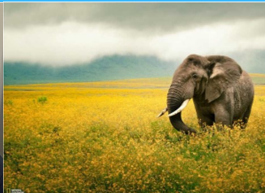
1 Bilbies—Ciara, Airle and Billie with their writing about the elephant stimulus picture.