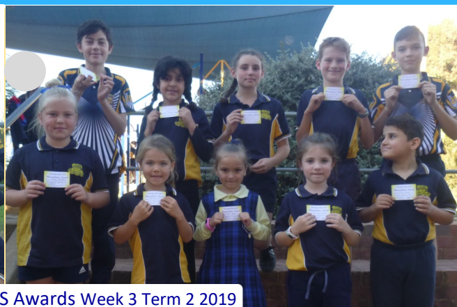
Achievement and Learning @ SWPS Awards Week 3 Term 2 2019