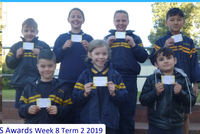
Achievement and Learning @ SWPS Awards Week 8 Term 2 2019