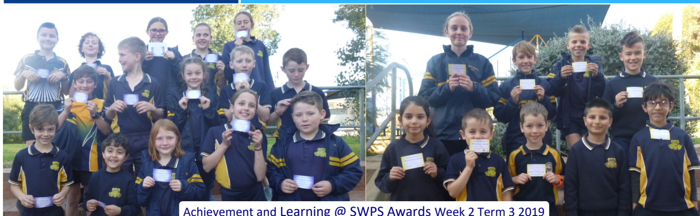
Achievement and Learning @ SWPS Awards Week 2 Term 3 2019