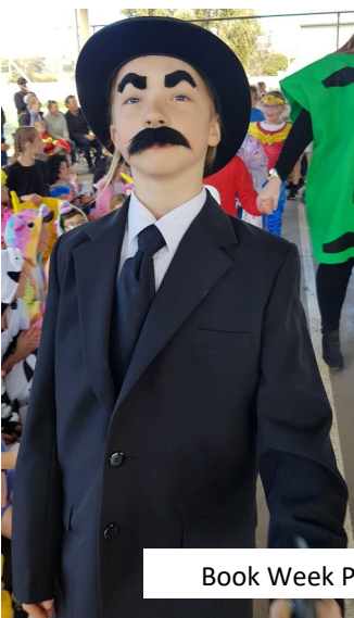
Book Week Parade 22 August

Participating in the survey is entirely voluntary. If you do not want your child to take part in the survey, please complete the form sent home today and return it to your child's school by Friday 30 August.