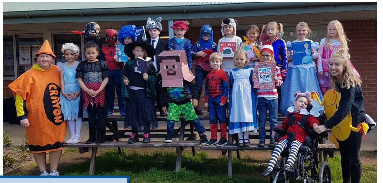
Book Week Parade 22 August