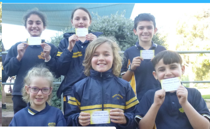
Achievement and Learning @ SWPS Awards Week 5 Term 3 2019