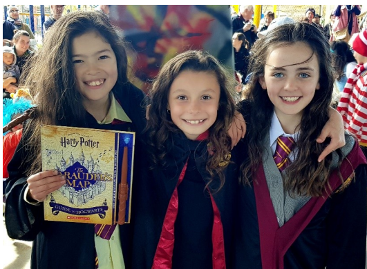
Book Week Parade 22 August

Alternatively, everyone is welcome to attend our first information and planning session on Tuesday 10 September at 3:30pm at the COLA. Students and teachers are encouraged to join us.