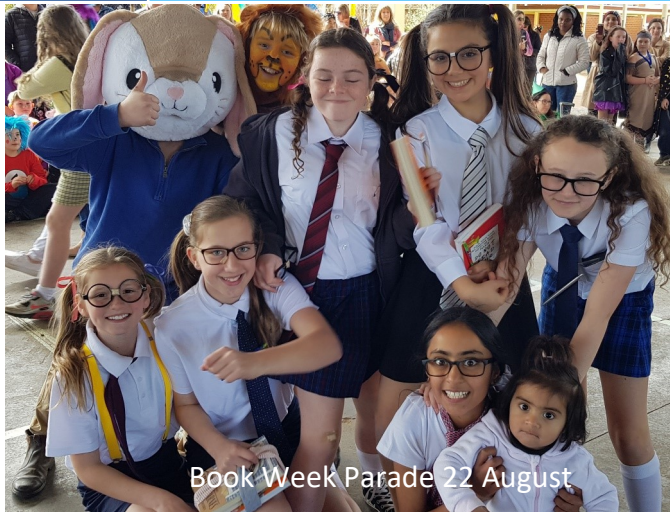
Book Week Parade 22 August