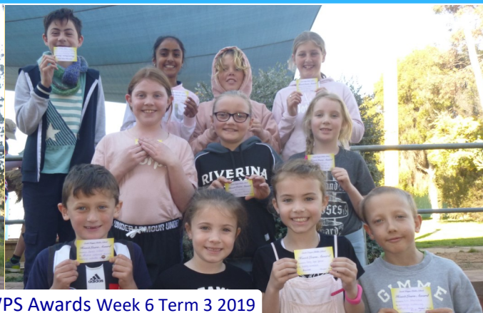
Achievement and Learning @ SWPS Awards Week 6 Term 3 2019