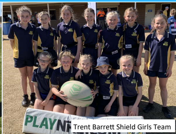
Trent Barrett Shield Girls Team