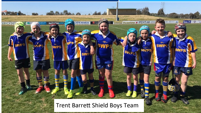
Trent Barrett Shield Boys Team