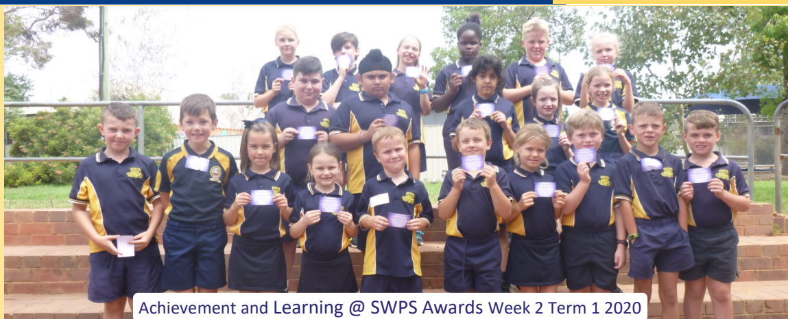
Achievement and Learning @ SWPS Awards Week 2 Term 1 2020